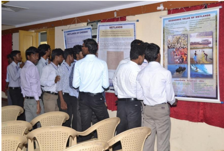
College students viewing the exhibition on River Basins of Tamilnadu at Madha Engineering College, Kundrathur