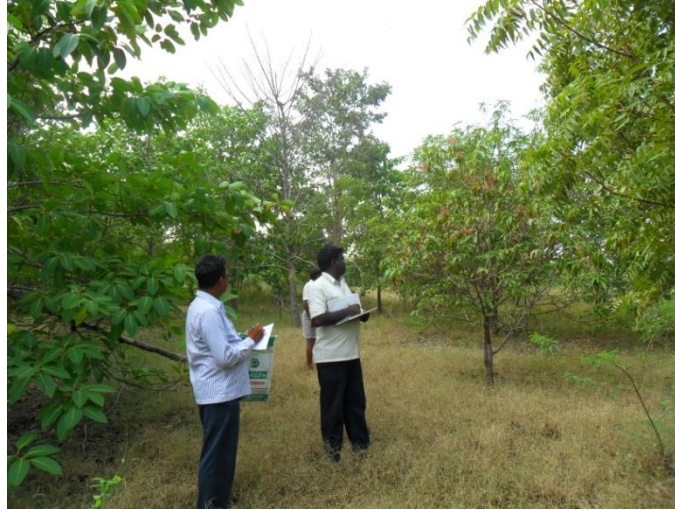
Madurai Meenakshi Amman temple lands at Koodalchengulam

CPREEC has been conserving and restoring sacred groves since 1993-94. Tree plantation and maintenance have been going on in the existing eight sites in the states of Karnataka and Tamilnadu. Orientation programmes for school students were organized at the sacred grove sites to motivate them towards sacred grove conservation. CPREEC has established a nakshatra van on the lands of the Meenakshi Temple at Madurai. This has been extended to a grove of kadamba and mahua trees, sacred to Goddess Meenakshi.