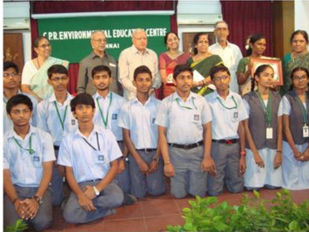
Principal and students of Sri Sankara Vidyalaya Matriculation Higher Secondary School, Pammal, Chennai receiving the Best Green School Award from Dr. M.S. Swaminathan, Chairman, CPREEC