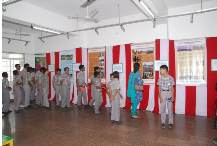
Students viewing the exhibition on Green Pilgrimage