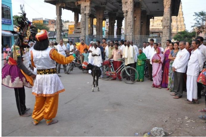
Street play enacted before the Ekambareswarar Temple in Kanchipuram

Awareness education programmes through street play on the ill effects of plastics were conducted in schools and public places of Chennai, Kanchipuram, Thiruvallur, and Vellore districts of Tamil Nadu, supported by the department of Environment, Government of Tamil Nadu.