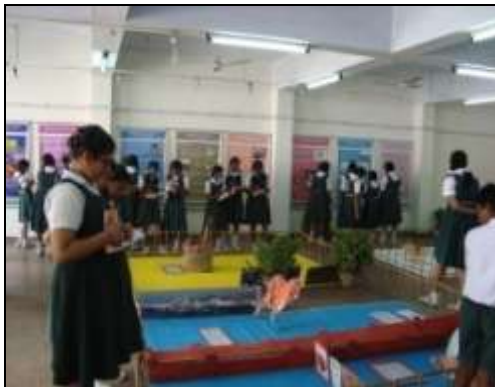
Students of M.Ct.M. Chidambaram Chettiyar Matriculation School at the Exhibition