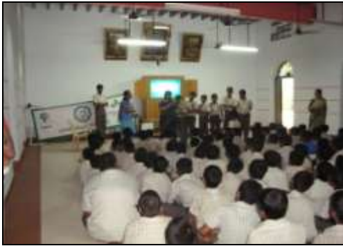
P.S.Higher secondary school, Chennai attending the Lecture on Non-violence towards Nature through vegetarianism Conducted as a part of