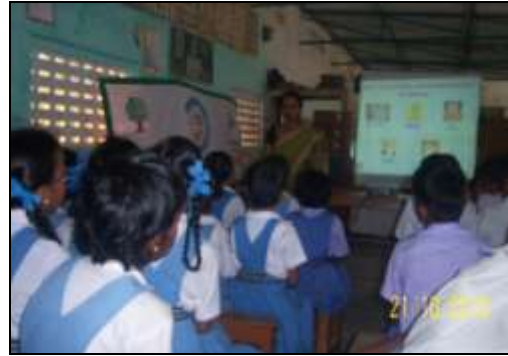
Students of Queen Mary's English school, Lawspet attending the Lecture on Non-violence towards Nature through vegetarianism Kompassionate kids programme held at Pondicherry.