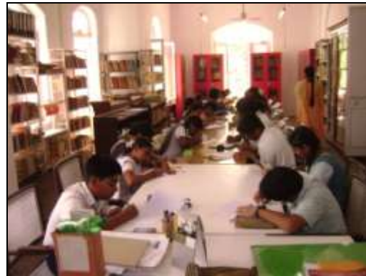
School Children at the Inter-school Creative-writing Competition