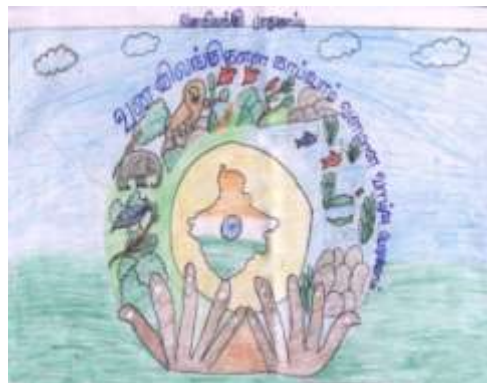
Winning entries of Poster designing competition at Chennai and Pondicherry