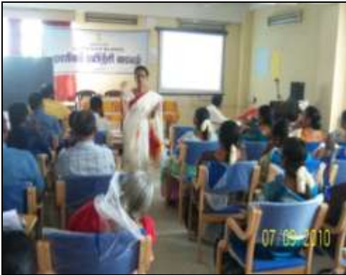
Teachers participated in the workshop organized by CPREEC in association with State training

Due to the immense success of the programme in Chennai, CPREEC extended the programme to Pondicherry for the teachers in association with the Environmental Education cell, State training centre-Directorate of school Education Pondicherry. The workshop was held on 7.10.10 which was attended by 40 teachers of Pondicherry. As a part of the programme they were taken to the Department of forest rescue and animal shelter.