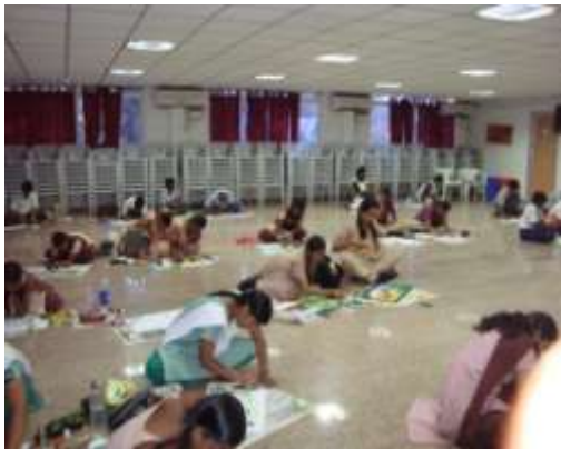
POSTER DESIGNING COMPETITION

CPREEC organized an inter school poster designing competition in Chennai for Std. VI to VIII on Protect Wild Life and for the students of Std. IX to XII on Farm Animal Welfare . Nearly 25 schools participated. The Participating students also conducted a signature campaign to protect animals.