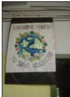
Poster on conserving wildlife was made by the Students of P.S.B.B., T.Nagar