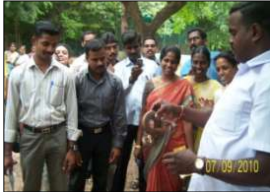
The resource person explaining about the animal care at the Department of forest rescue and animal shelter.