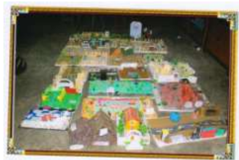
58 models of Animal shelters prepared by students of Sri Sankara Vidhyalaya, Pammal