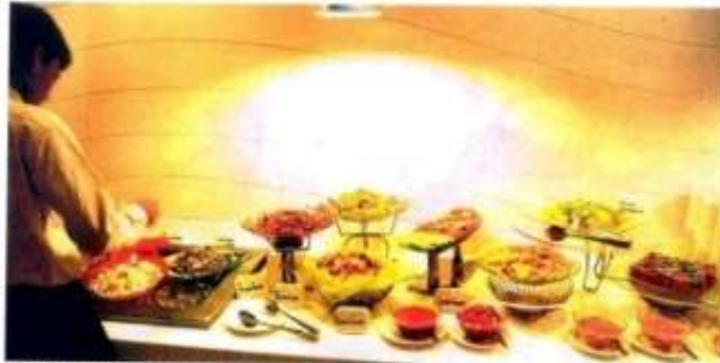
MAKE VEGETABLES A WAY OF LIFE It's environment-friendly

Besides this direct impact, much of the environmental damage that our planet is now reeling under can be attributed to the livestock industry. The World Watch issue July/August 2004, concludes: The human appetite for animal flesh is a driving force behind virtually every major category of environmental damage now threatening the future of the globe — deforestation, erosion, fresh water scarcity, air and water pollution, climate change, biodiversity loss, social injustice, destabilisa-